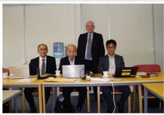
Japanese Standards Association visitors

The key committees and working groups in which AMDEA is involved are: