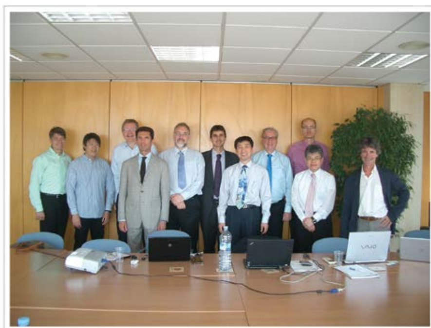
IEC Advisory Committee on Environmental Aspects May 2014

We also, on occasion, host meetings and this year was no exception with several CENELEC Working Groups and an IEC committee meeting at AMDEA in the spring, as well as a visit from the Japanese standards body wanting to consult AMDEA.