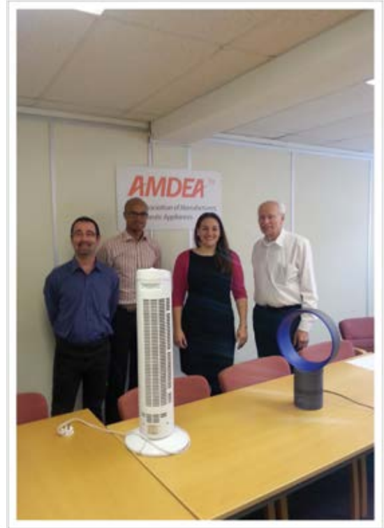
CENELEC Fans Working Group April 2014