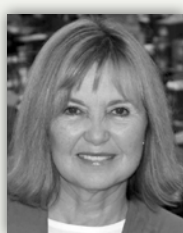
Lorna Fellowes Triton Showers